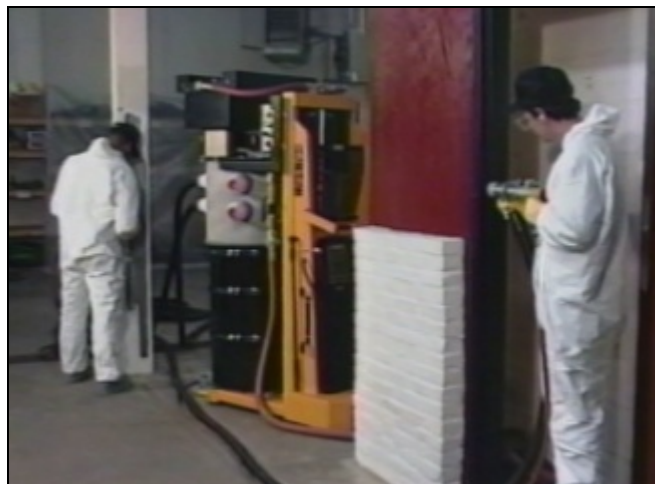
The VAC-PAC® is easily transported and provides multiple ports for multiple tool operation.