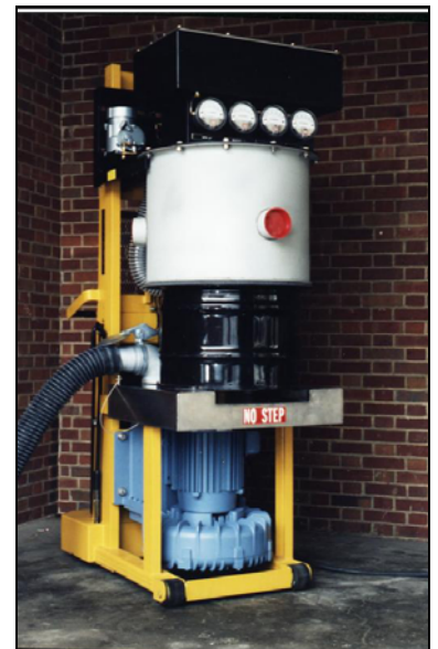
Electric-powered VAC-PACs® offer optional drawer-mounted waste drums for portability.