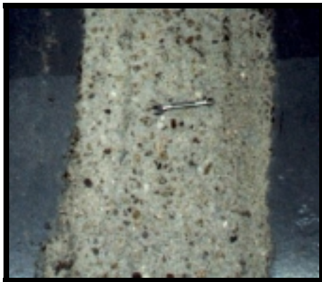
Close-up of concrete surface scabbled by MOOSE ® .